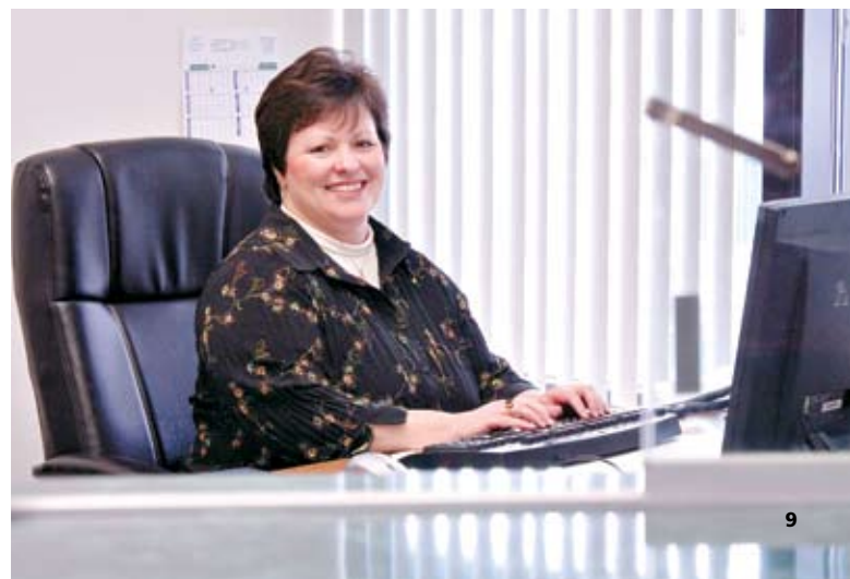
Courteous and experienced professionals deliver first-class customer service.

ECS strives to have a thorough understanding of its client’s business, applications and processes, and how they can be modified to maximize their return on investment. The company’s goal is to design, implement and support effective long-term telecommunication systems and solutions. ▸