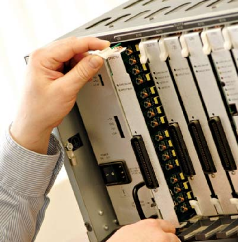
ECS is always looking to provide the most up-to-date technology available today.

"If a customer has a receptionist at every location, you can centralize with voice over IP," Sherman says. "The customer that is calling has no idea that their call is being handled in Erie or Meadville. We take a good look at long-distance calls between offices and whether the current connections are fulfilling your data requirements with enough bandwidth." Customers gain maximum value from ECS technicians, who are Microsoft- and network-certified and have undergone extensive technical training. An added bonus is the company's onsite training center, where customers can test the latest equipment.