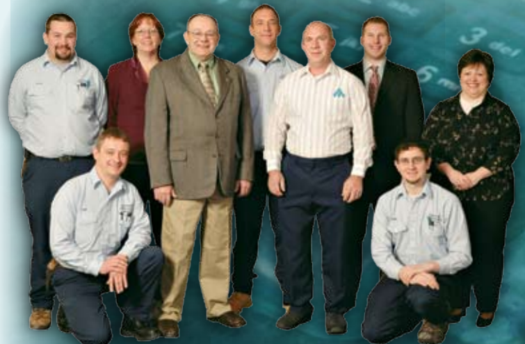
A dedicated team of employees is the hallmark of ECS.